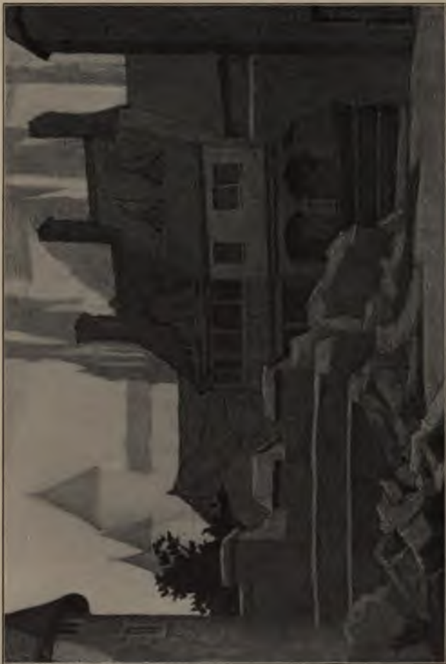
ACT FOURTH, SCENE II : A STREET IN RHEIMS